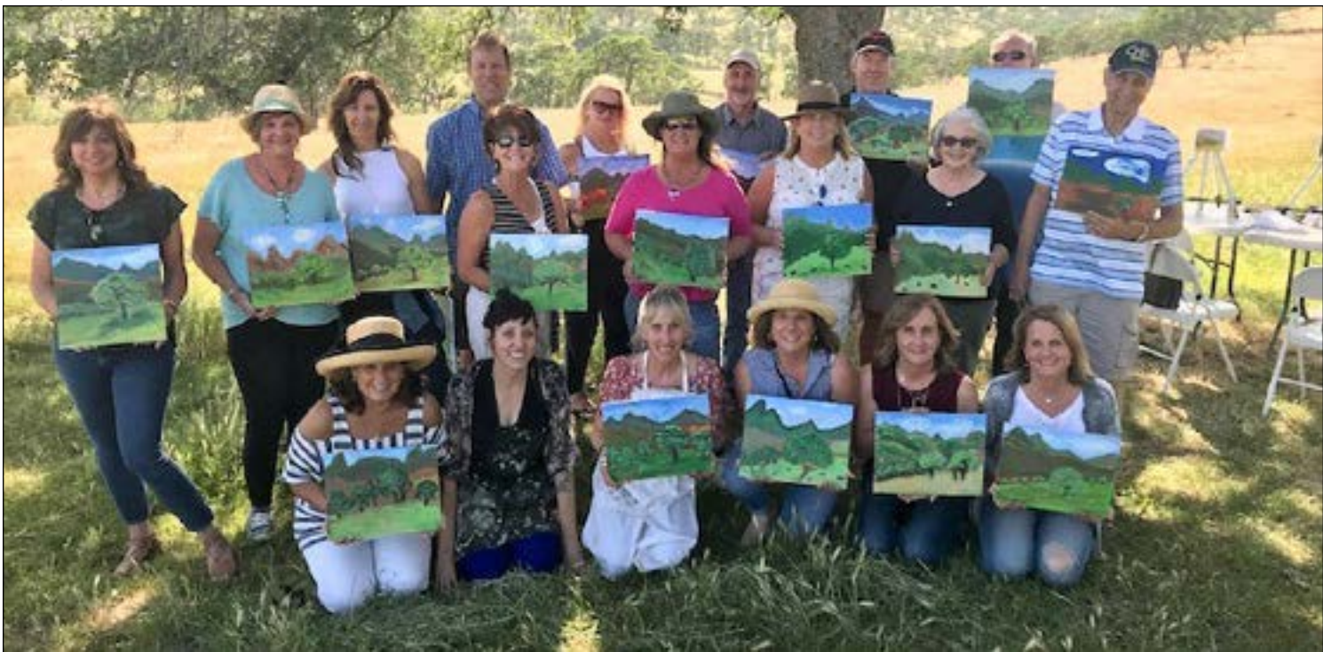
Art Party in the Buttes

email@yubasutterarts.org yubasutterarts.org facebook.com/yubasutterarts530 instagram.com/yubasutterarts530