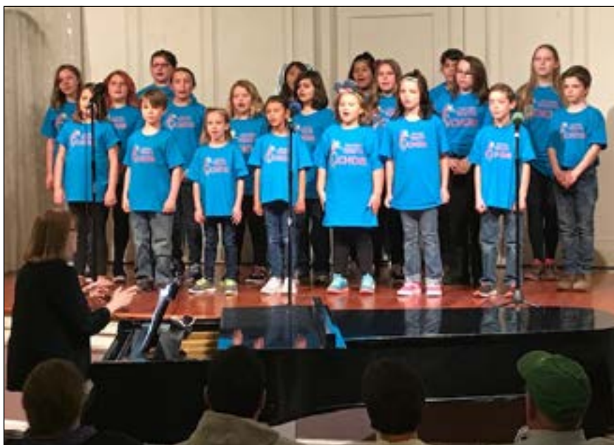
Yuba Sutter Youth Choir

Both of these youth performing arts programs were casualties of the pandemic in terms of live rehearsal and performances. However, Applause Kids! did create three virtual musicals including "Super Happy Awesome News," "Should you Hug A Cactus," and a holiday show.