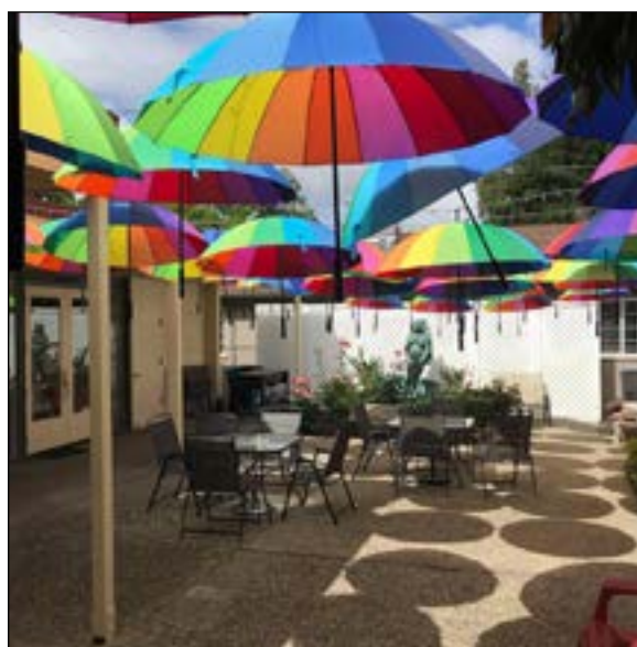
Right: Umbrella Sky; Below: The Gallery at Yuba Sutter Arts

A signature program of Yuba Sutter Arts and Culture, we work with venues to create small-scale galleries in traditional and nontraditional spaces such as offices, government buildings, restaurants and retail locations, each of which host two to four artists' shows each year. Sharing art and exposure for our artists is key to our belief in Art Everywhere!