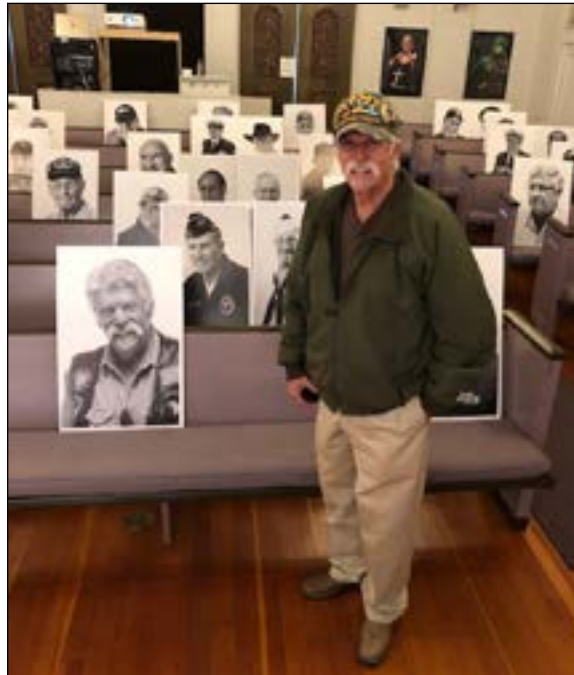
Right: Veterans in the Arts; Bottom Left: Brahms in the Brothel; Bottom Right: Very Special Arts